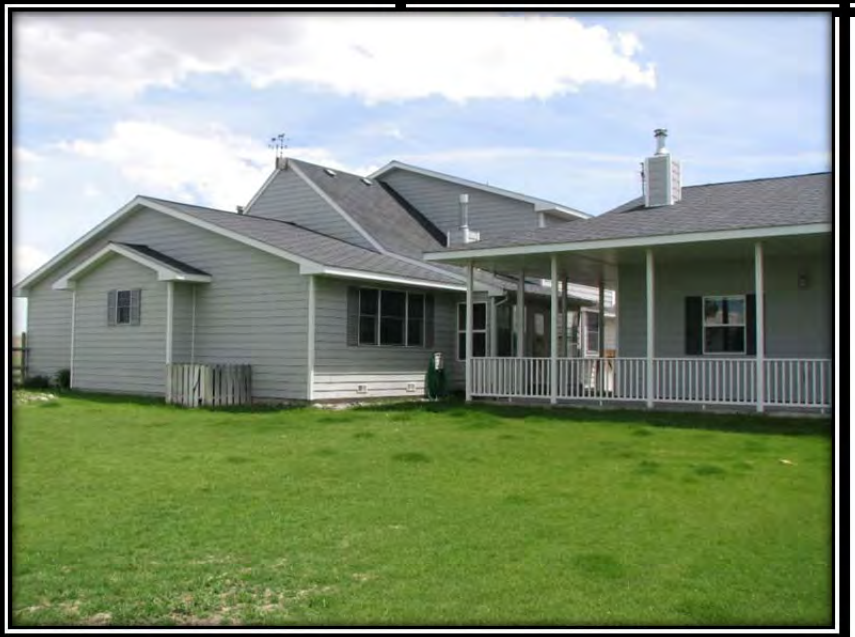
Rear of Home