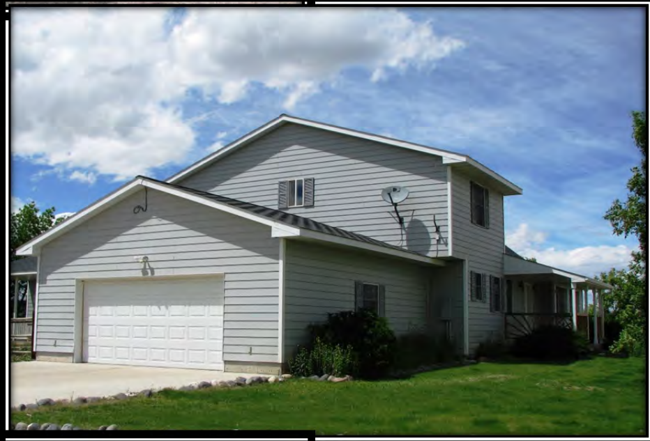
Garage & Front of House