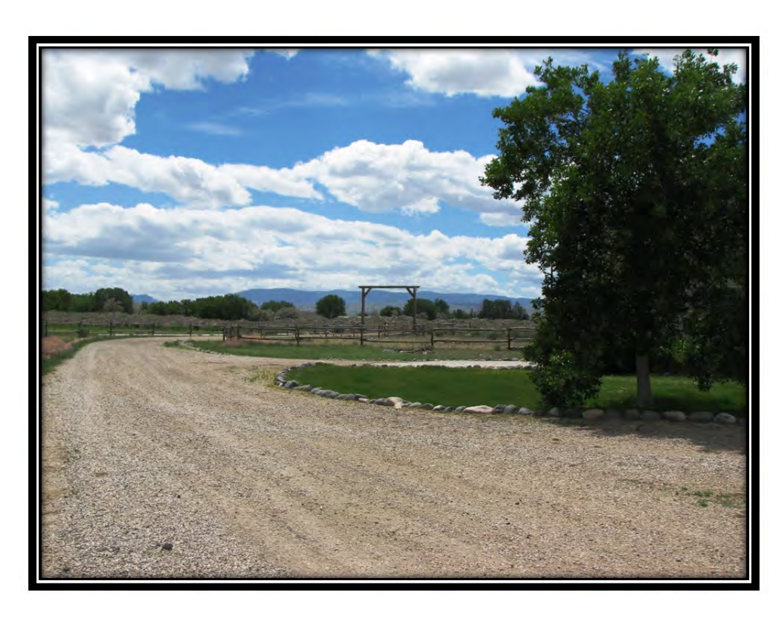
Country Living Near Powell Wyoming