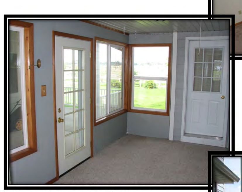
Sun Room with Access To Master Bedroom