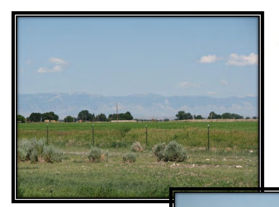
Bíg Horn Mountains